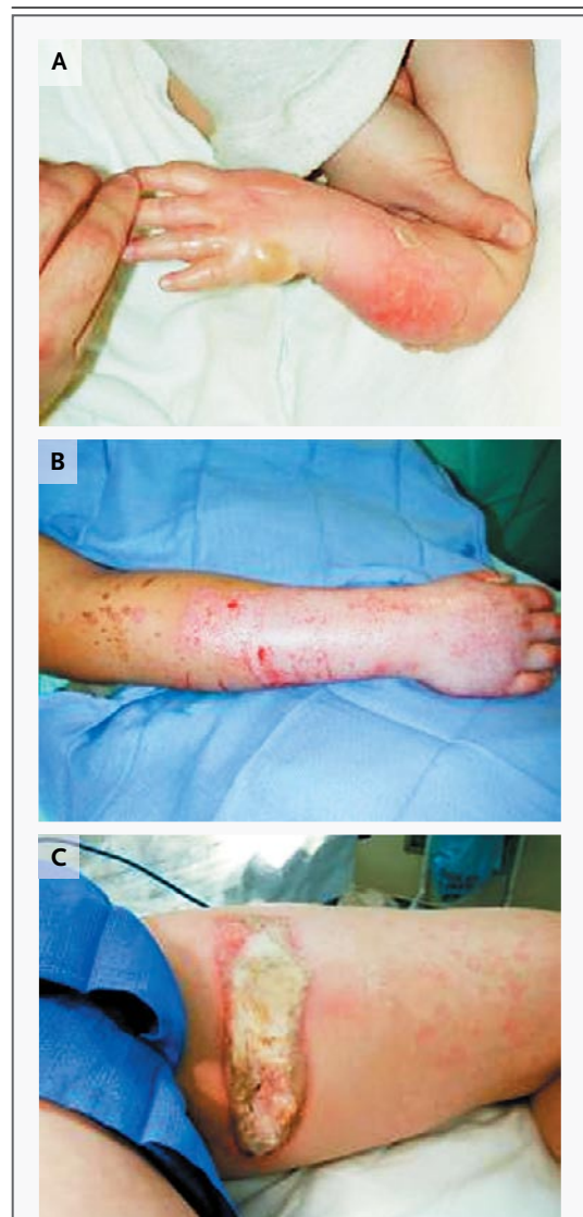
Figure 2. Determination of Burn Depth.

The debate regarding the removal of burn blisters has been fueled by conflicting data regarding the in vitro effects of blister fluid. Two clinical trials involving patients and volunteers with superficial burns demonstrated that intact blisters healed faster and were less likely to become infected than blisters that were ruptured. 48,49 These results are supported by a study in pigs, in which removal of the necrotic epidermis slowed reepithelialization and increased the rate of infection and scarring. 50 Blisters larger than 3 cm in diameter and those over mobile areas usually rupture spontaneously and may be aspirated under sterile conditions. 48 When blisters rupture,