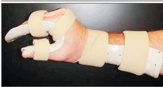
Figure 4. Position of Hand for Splinting Burns and Frostbites of the Hand.

particles. 62 The important exception to the treatment of a chemical burn with water lavage involves injury from the elemental metals (i.e., lithium, sodium, magnesium, and potassium), which spontaneously ignite with water. Exposure to hydrofluoric acid, which is used in etching and rust removal, leads to intense pain and tissue damage. 62,63 Treatment includes copious irrigation followed by the application of calcium gluconate gel or subcutaneous injection of calcium gluconate, with the goal of relieving the pain. A burn from hydrofluoric acid that involves more than 5% of total body-surface area, or more than 1% of total body-surface area if the concentration of hydrofluoric acid is greater than 50%, requires