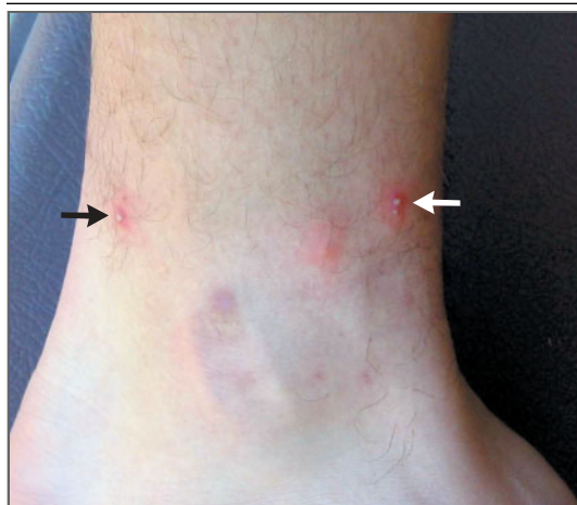
Figure 2. Stings from a Fire Ant on an Ankle, Showing the Pseudopustule.

The clustering of the stings (white arrow) contrasts with the single sting (black arrow) in the photograph, which was taken 24 hours after the event. This pattern is typical of fire-ant stings, as one ant will often inflict multiple stings in a semicircular arc if given time to do so. Also, the pseudopustule is typical of fire-ant stings; it is not a pustule. The stings occurred just above the level of the ankle sock the patient was wearing on the day of the event.